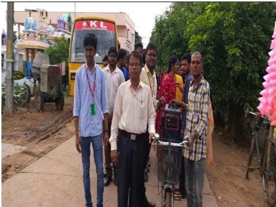
KLEF NSS Faculty Creating Awareness on Cleanliness to Shops owners on vaddeswaram on 19-09-2019

Date of Event : 19-09-2019 Name of Event : Swachh Bharath Venue : Vaddeswaram. No. of Participants : Students:100 Staff: 01