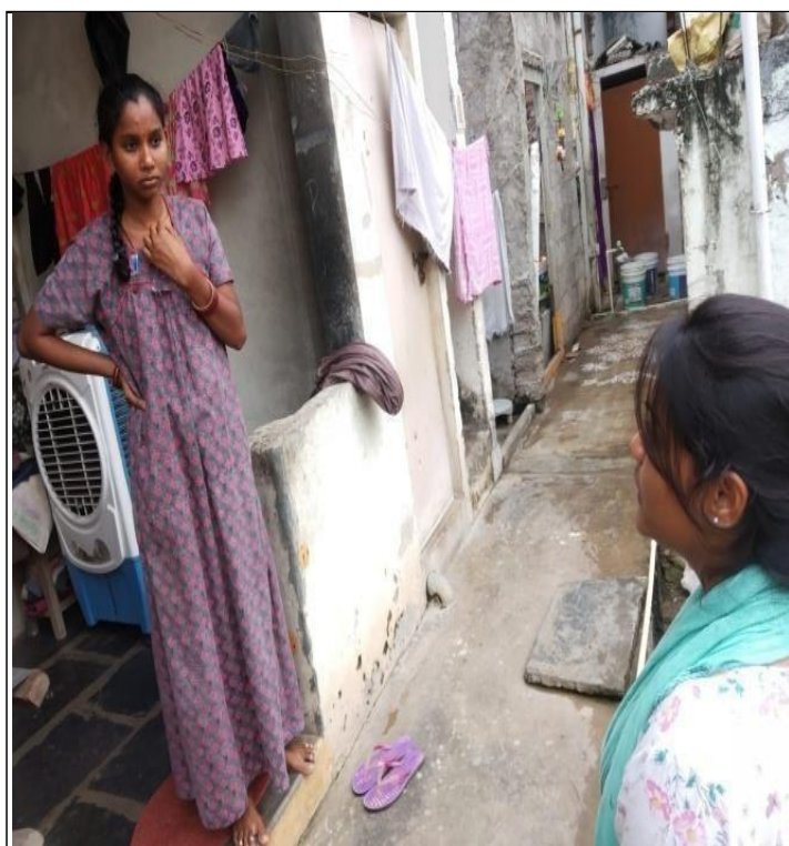
NSS Volunteers Awareness on Plastic effect to Villagers