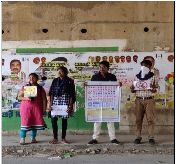
Volunteers giving Awareness Road Safety using Placards On 15-02-2020