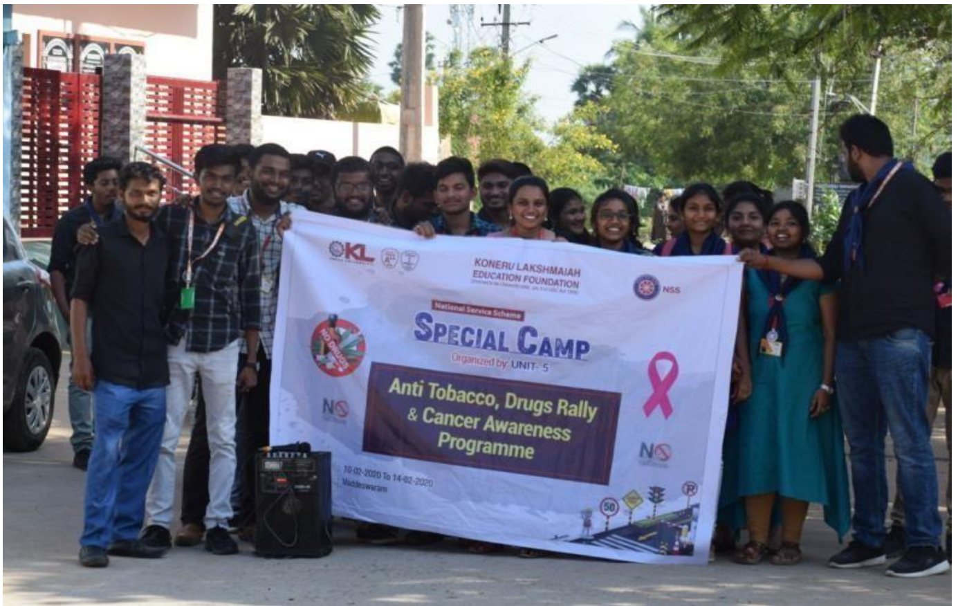
Rally on Awareness Anti Tobacco and Drugs at Vaddeswaram On 16-02-202

On the afternoon session NSS team conducted the event on tobacco awareness in vaddeswaram. In this event all our team being one, held the rally saying slogans that ‘madhyapanam dhoomapanam arogyaniki hanikaram’ and ‘pogatragadam cancer ku kaarakam’.