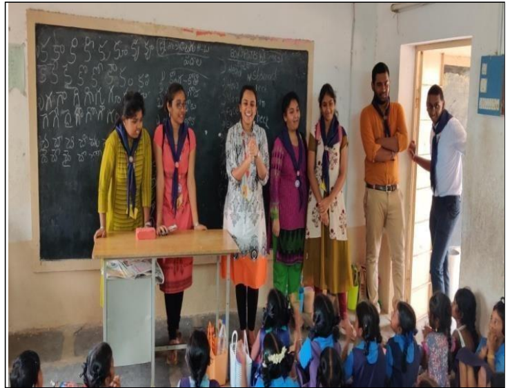
Volunteers Awareness on Computer Education to Vaddeswaram ZP High School on 11-02-20