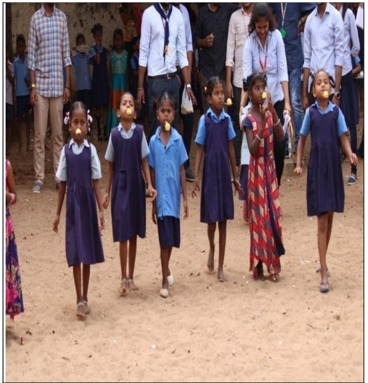
Team NSS Conducted Games to MPP School Students at Vaddeswaram on 13-02-20