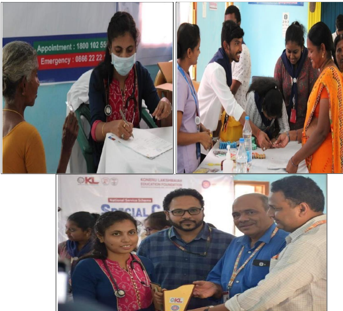
Free Health Check up Camp Utilization the Villagers on 14-02-20

130 villagers turn up for the check-up. The people who had eye check-up were provided free spectacles. At the end of the event the doctor is felicitated by a shawl and momentum by Dr.Vijay kumar. NSS Unit organized free health camp for villagers of kolanukonda.