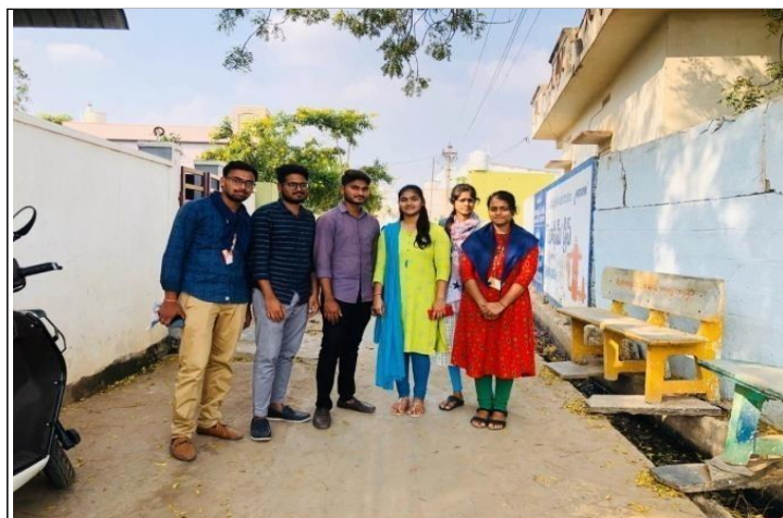
Volunteers Awareness on Sanitation to Villagers and Clean the Temple Premises on 12-02-20