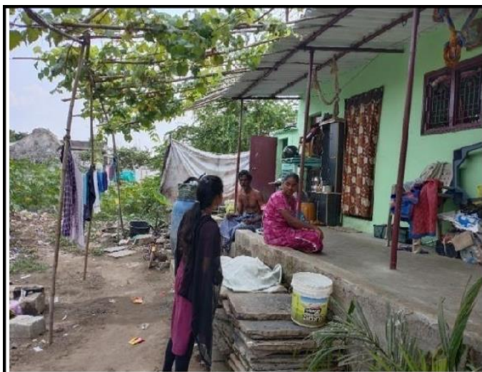
Awareness on Sanitation

After reaching the village, volunteers met the panchayat member and identified the places to do cleaning activity. The panchayat members arranged all the equipment needed to clean. And some of the people went to door to door about saying about medical camp details and awareness on plastic and some of the volunteers went to park and they cleaned the park neatly and there is a water tank and with ladder and painted the ladder .