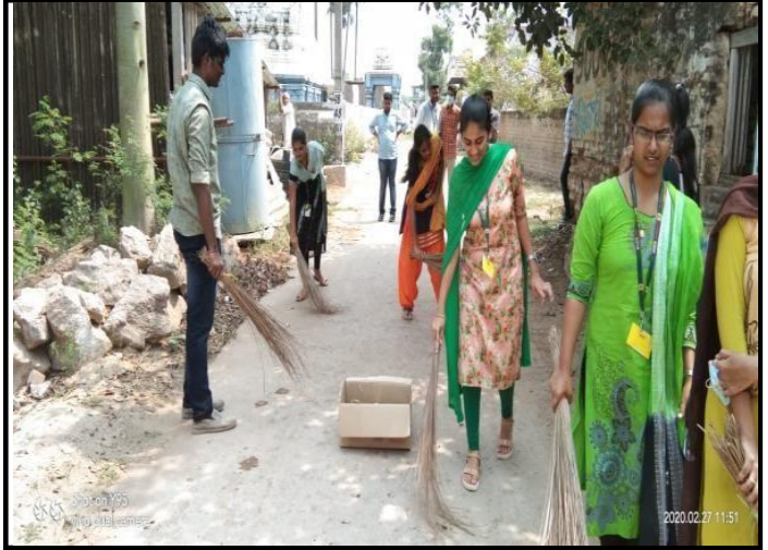
Clean the Roads on Prathuru Village

Some people who went to cleaning ,they also cleaned the drainages too because it Is not some people work ,all have a right to clean the drainages and it is not shame to clean and our friends done it . Sanitation should not be seen as a political tool, but should only be connected to patriotism and commitment to public health”