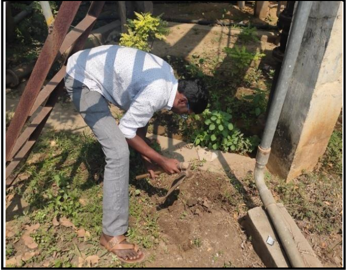
Cleaning of Water Tank Premises on 27/02/2020

In park some of the volunteers of NSS cleaned all waste and watered the walls to do painting. “If we desire to be close to Spirit of God, we desire to dwell in clean soul with a clean body.” “The state of our surroundings, tells the conditions of our soul.” “He citizens must begin to work to clean the city and country of any dirt.” “Desire to dwell in clean environment.”