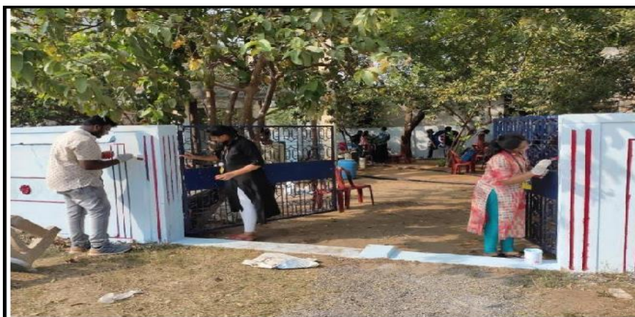
Volunteers Decoration to the Water Tank Compound Wall