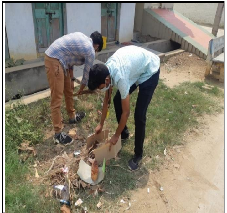
Clean the village Roads

Some of the people who came for painting done lots of hardworking mixing the large amounts of cement and painting to the walls and our faculty also done the painting.