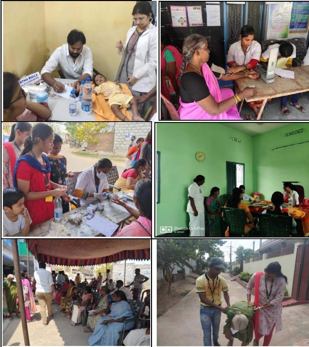
Doctors and Technicians Check up the Prathuru Villagers

the village. We conducted free medical tests to the people who came to the camp and we situated the camp in the local Panchayat office as it was situated in the heart of the village. We also made announcement using mike to get to the people who are situated in the corner of the village and we received a great response.