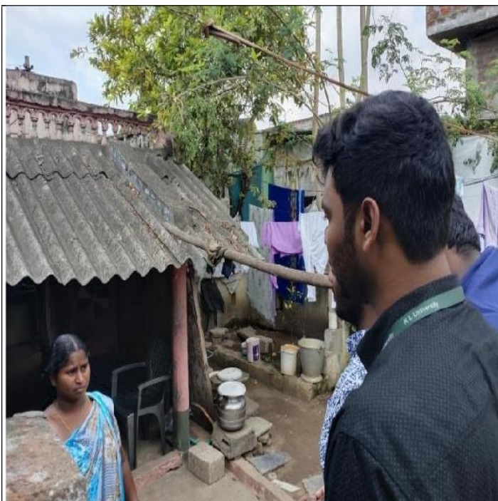
Awareness on Sanitation

“You have a responsibility to keep your homes, surroundings and city clean.”