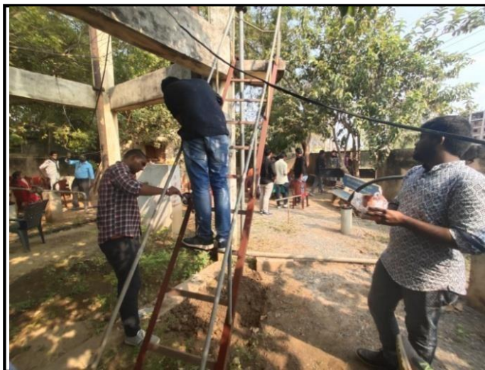
Painting of Water Tank Compound Wall