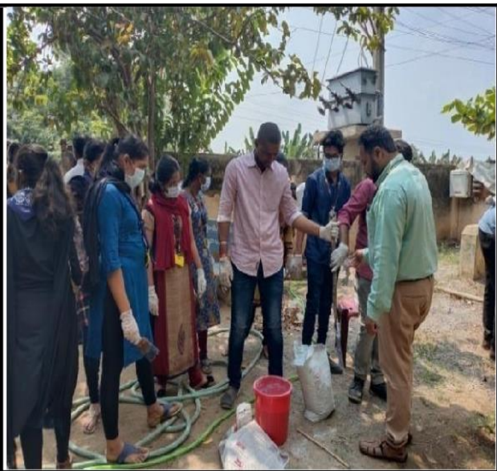
Spry the bleaching in Water Tank Premises

After reaching the village, volunteers met the panchayat member and identified the places to do cleaning activity. The panchayat members arranged all the equipment needed to clean. And some of the people went to do the park cleaning and painting and some of the people went to do plantation and swachh Bharath.