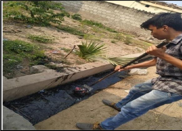
Cleaning Volunteers the inside of Drainage