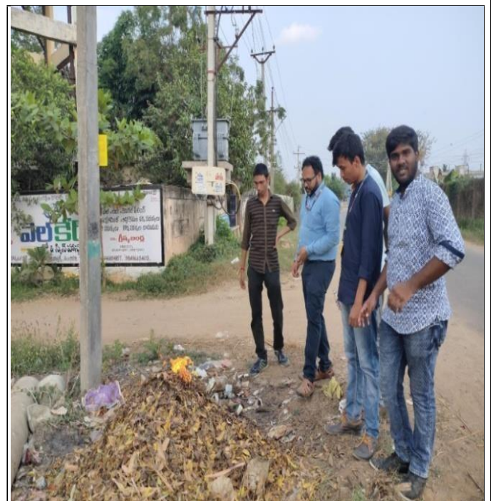
Volunteers observe the Dry waste