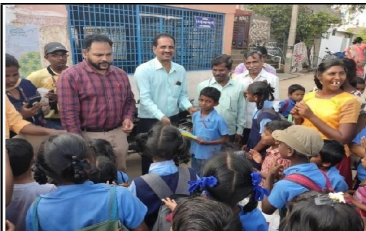
NSS Conducted Competitions to school students and Prize distribution by Panchayat Secretary & NSS PC on 29/02/2020