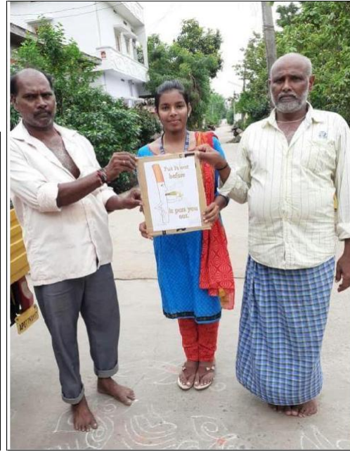
Placards which depicts effects of Tobacco Consumption

Some volunteers interacted with the villagers and informed about the harmful effects of consumption of tobacco. Some of the volunteers also spread door to door awareness about the “Tobacco Consumption” by holding placards. Placards create a great impact than words.