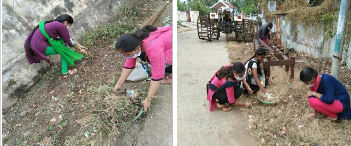
Clean the Roads on Swachh Bharat at Pedapalem

Also, Mud oil team went to different places of the village and sprayed the mud oil in the drainages of the village so that it will decrease the mosquitoes.