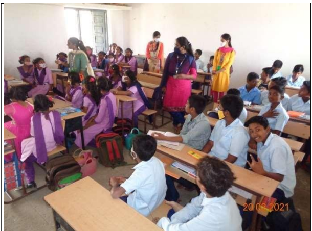
NSSvolunteers creating awareness among the students onAntiTobacco&StoptoJunkFood