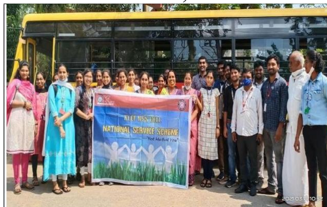
Group Photo in village

“Let’s practice motivation and love, not discrimination and hate”