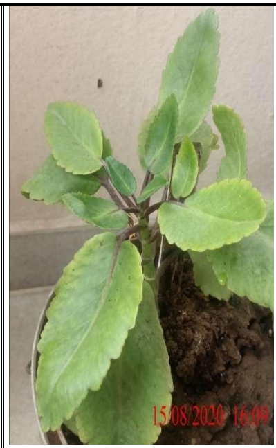
Plantation @ Home Program