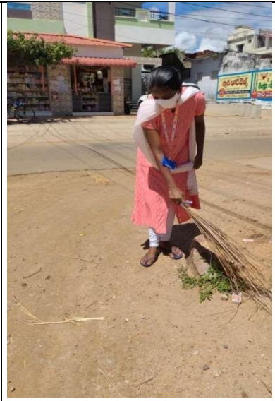
Students diligently working to tidy up the streets and roads on 02/10/21