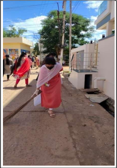
Students diligently working to tidy up the streets and roads on 02/10/21