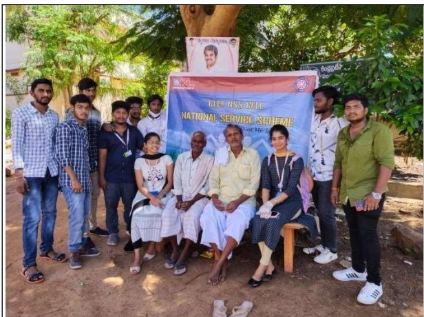
Students are actively engaged in Swachh Bharat activities in Ippatam village on 02/10/21,