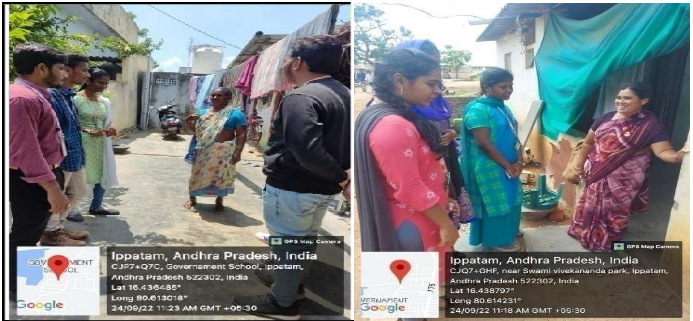
Students educating the villagers regarding the Seasonal Diseases in the village on 24/09/22