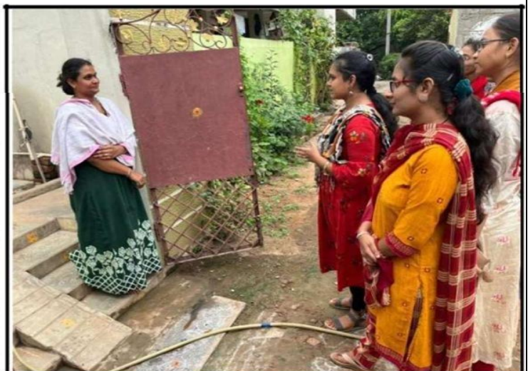
Students creating awareness among the villagers regarding the accidents which will happendue to stick stove and also unpredictable accidents due to improper use of gas stove on 15/12/22