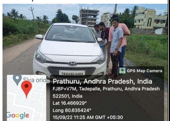
Students creating awareness about traffic rules and wearing seat belt for personal safety for four wheelers at panchayat office on 15/09/22