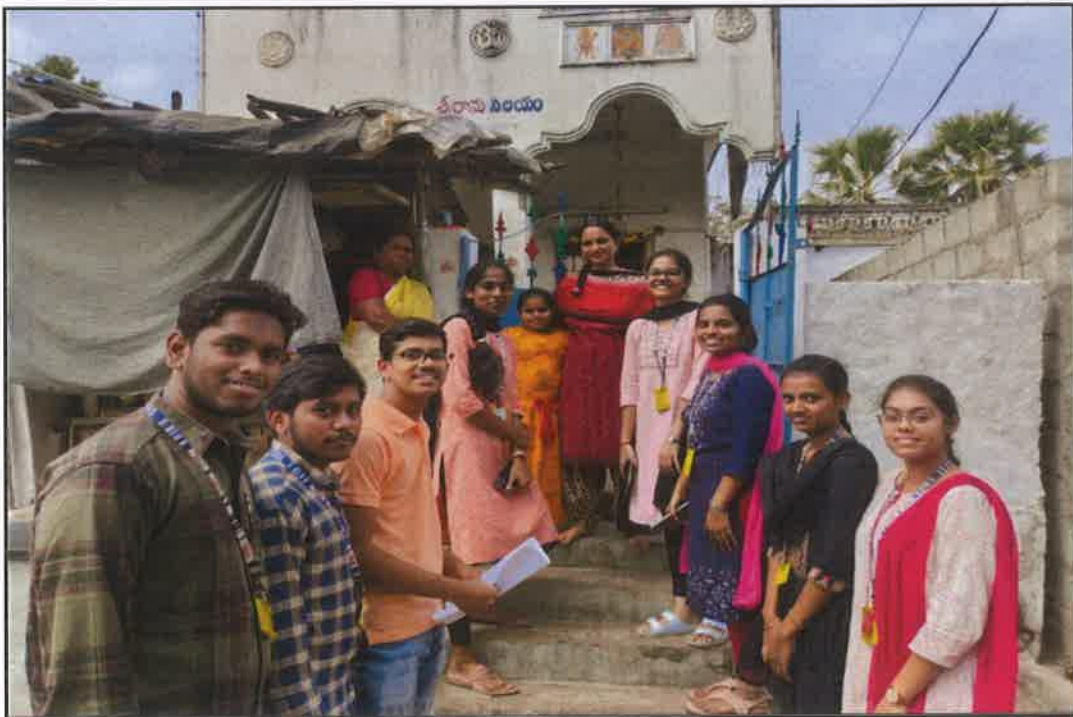
Volunteers campaign on Right to Vote to Villagers at Pedapalem on 25-01-2024