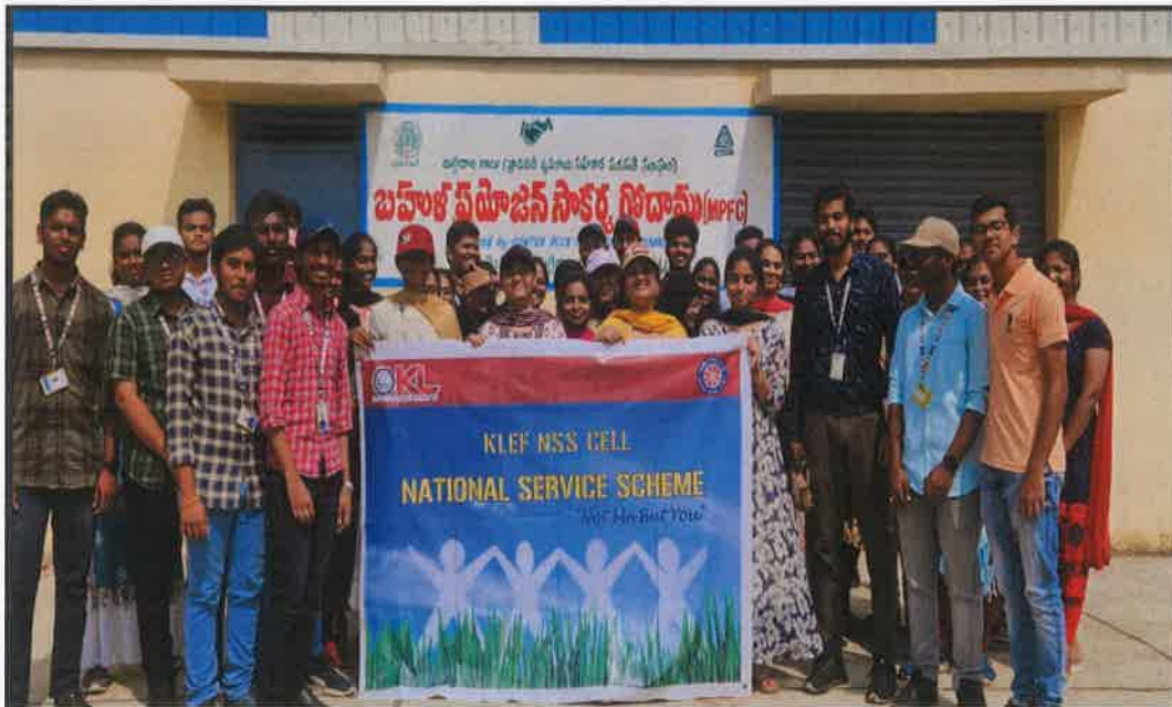
Team of NSS Volunteers Campaign on Right to Vote at Pedapalem on 25-01-2024