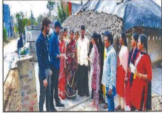
అవగాహన కల్పిస్తున్న యూనివర్సిటీ విద్యార్థులు