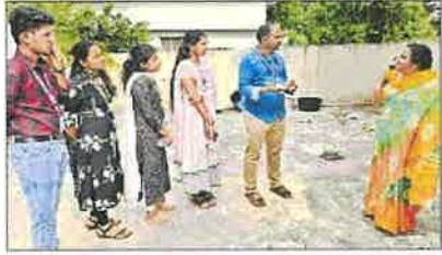
అవగాహన కల్పిస్తున్న విద్యార్థులు