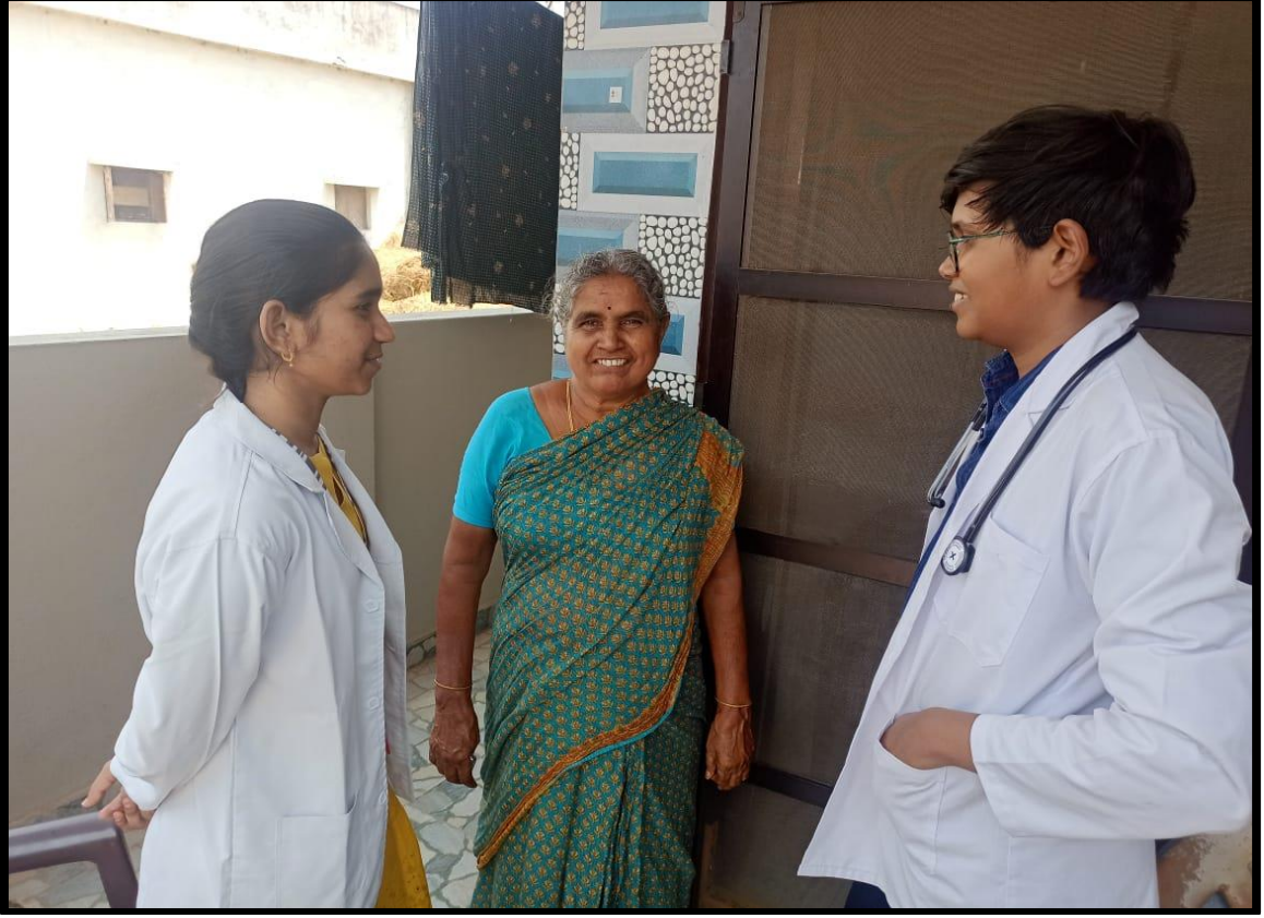
volunteers creating awareness among adults about taking immunization vaccines on time Press Clippings: