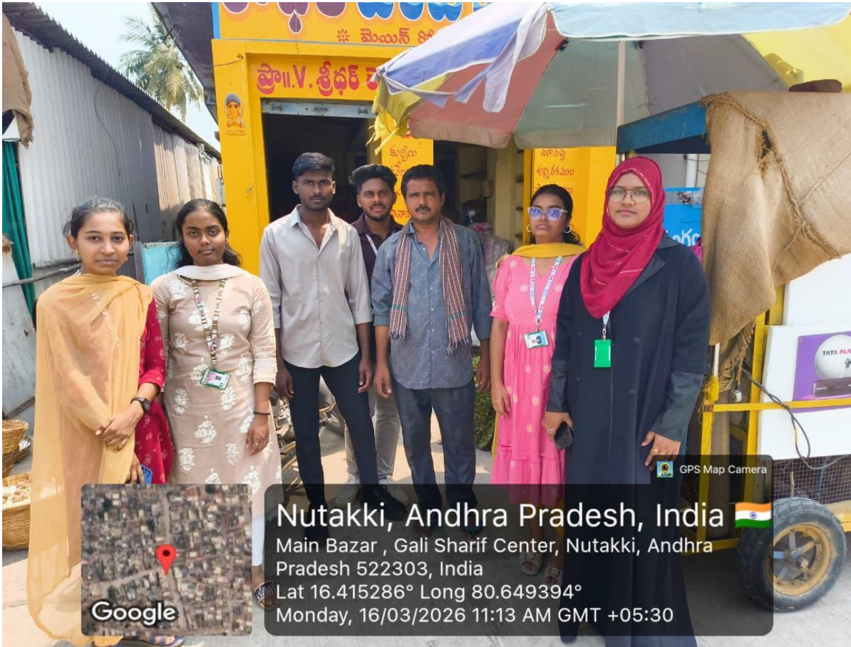
Nutakki, Andhra Pradesh, India Main Bazar, Gali Sharif Center, Nutakki, Andhra Pradesh 522303, India Lat 16.415286° Long 80.649394° Monday, 16/03/2026 11:13 AM GMT +05:30