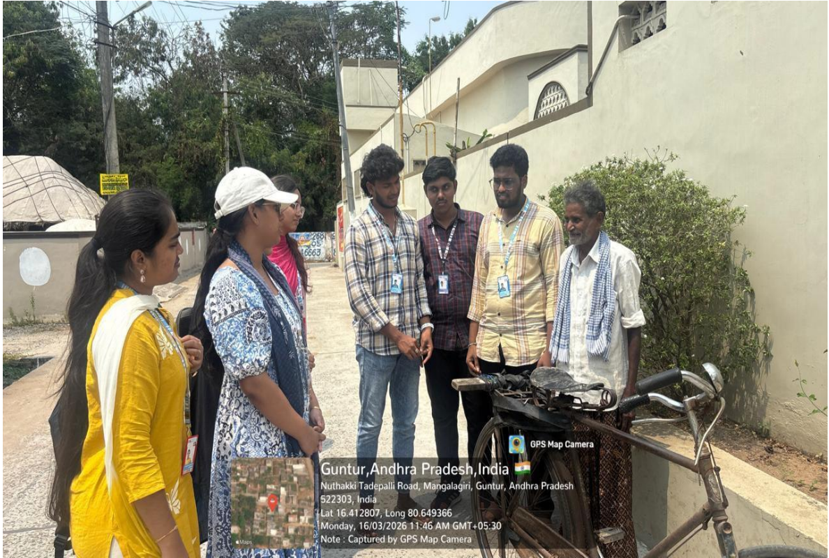
Guntur, Andhra Pradesh, India Nuthakki Tadepalli Road, Mangalagiri, Guntur, Andhra Pradesh 522303, India Lat 16.412807, Long 80.649366 Monday, 16/03/2026 11:46 AM GMT+05:30