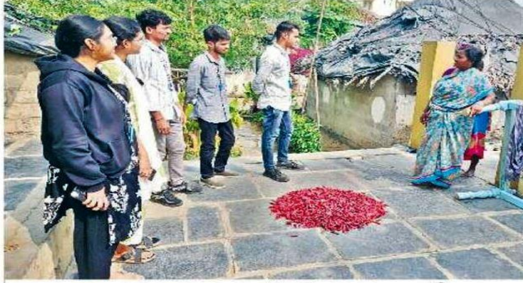
అవగాహన కల్పిస్తున్న కేఎల్ యూ వాలంటీర్లు