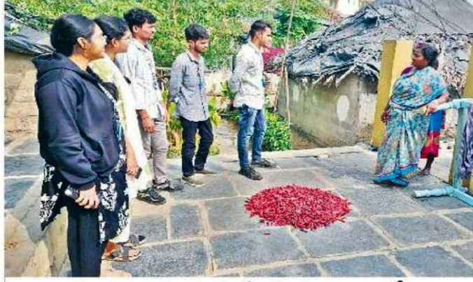
అవగాహన కల్పిస్తున్న కేఎల్ యూ వాలంటీర్లు