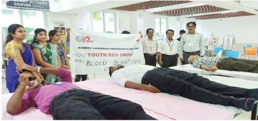
రక్తదానం చేస్తున్న విద్యార్థులు