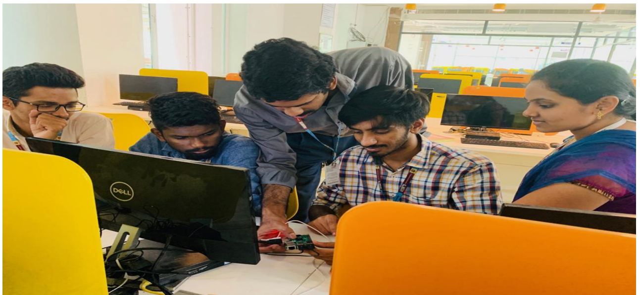
A glimpse of Hands on Sessions held on Python and IOT training