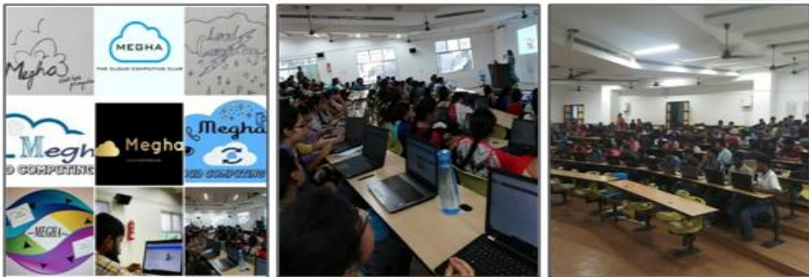
Megha Club Activities