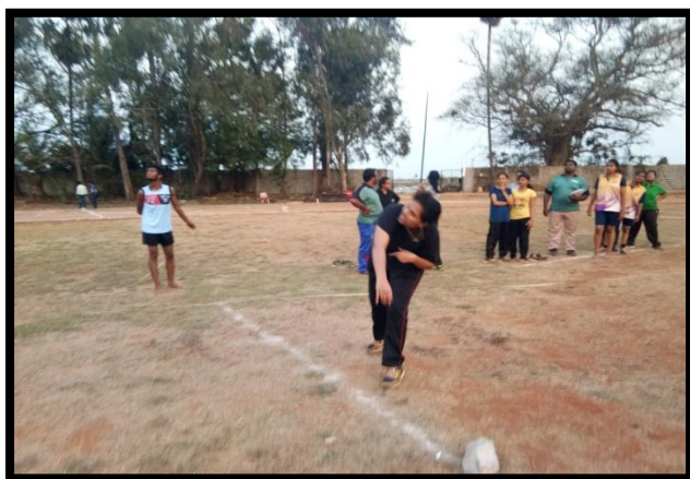
Sports Event and Prize Distribution Photos