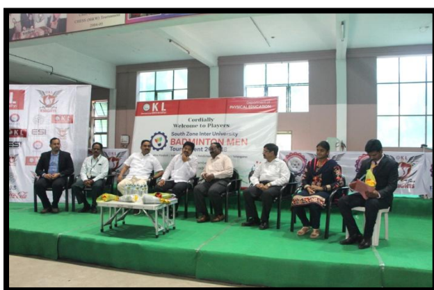
Badminton tournament and closing ceremony photos