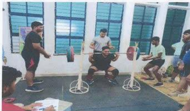
Powerlifting Players in Action on 16.02.2023