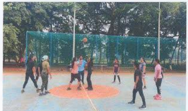
A Player in Action on 12.02.2023