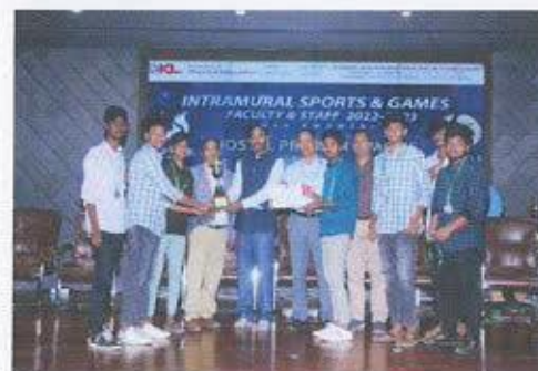
University Authorities Appreciation to Top Players of KLEF on 01.04.2022

[Handwritten Signature] REGISTRAR Koneru Lakshmaiah Education Foundation (Deemed to be University) Green Fields, VADDESARAM-522 302. Guntur District, Andhra Pradesh.