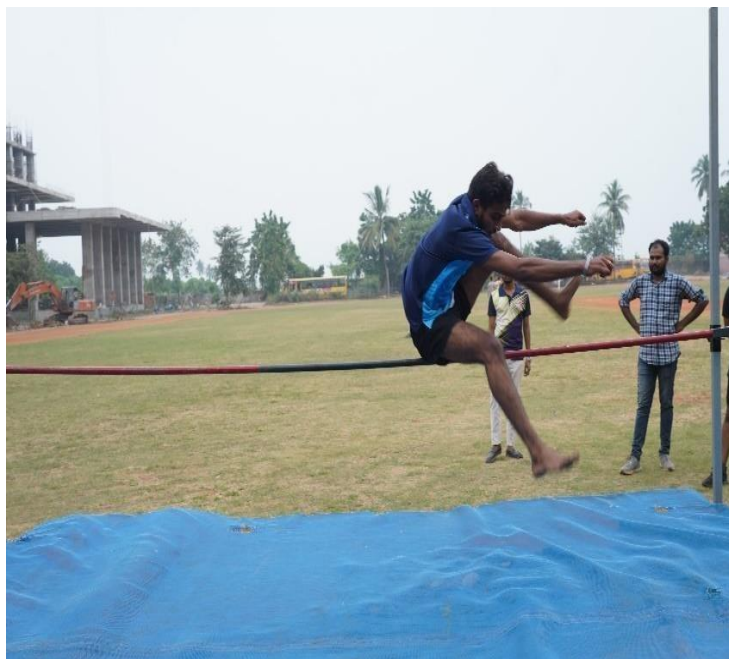
Above all, the photos depict action in athletics on 05.01.2025