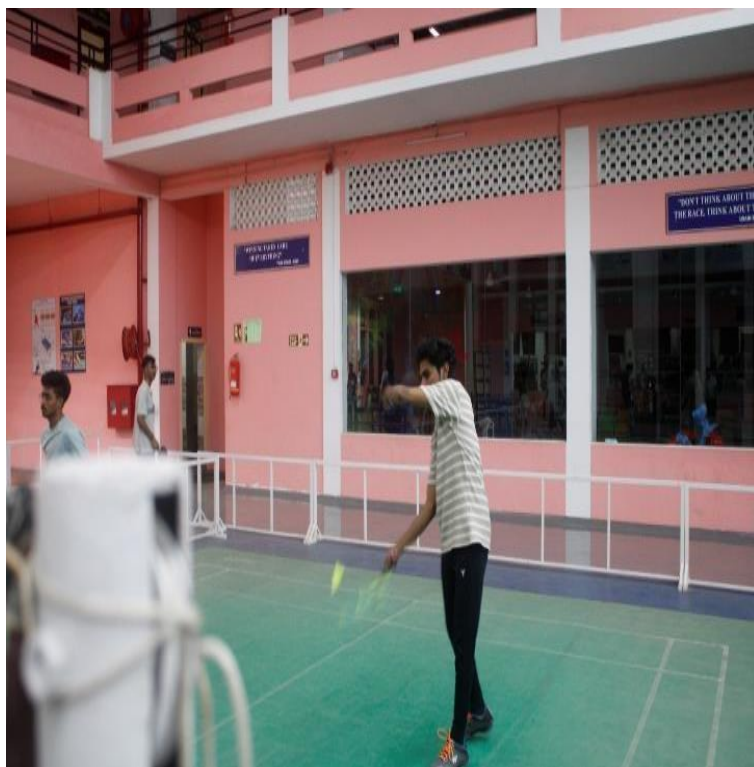
Photos of Kho-Kho and Badminton action taken on 03.01.2025