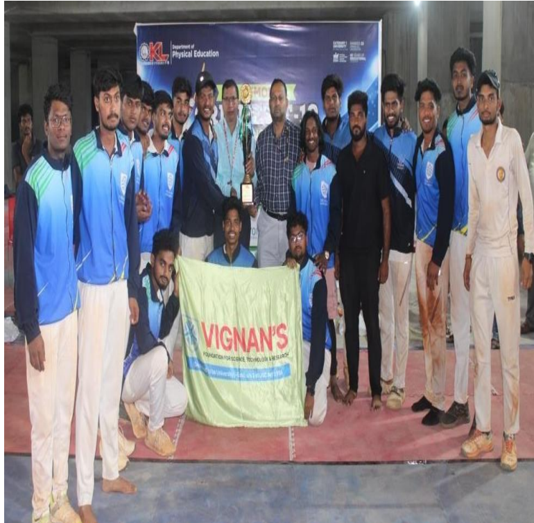
Runner UP: Vignan's University (22 nd March 2025)