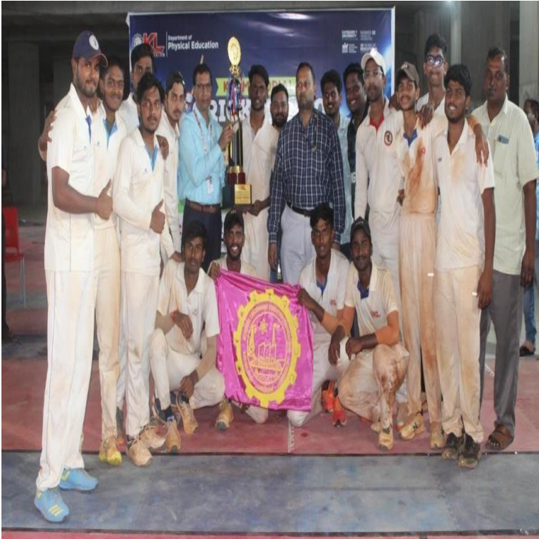
Winner: K L University (22 nd March 2025)