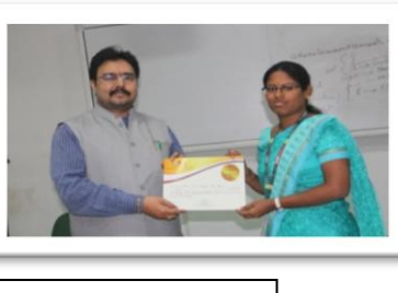
Participants receiving the certificates at the end of the session