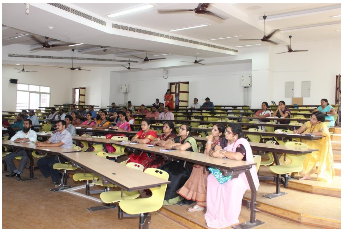
Resource Person actively involving participants in discussions