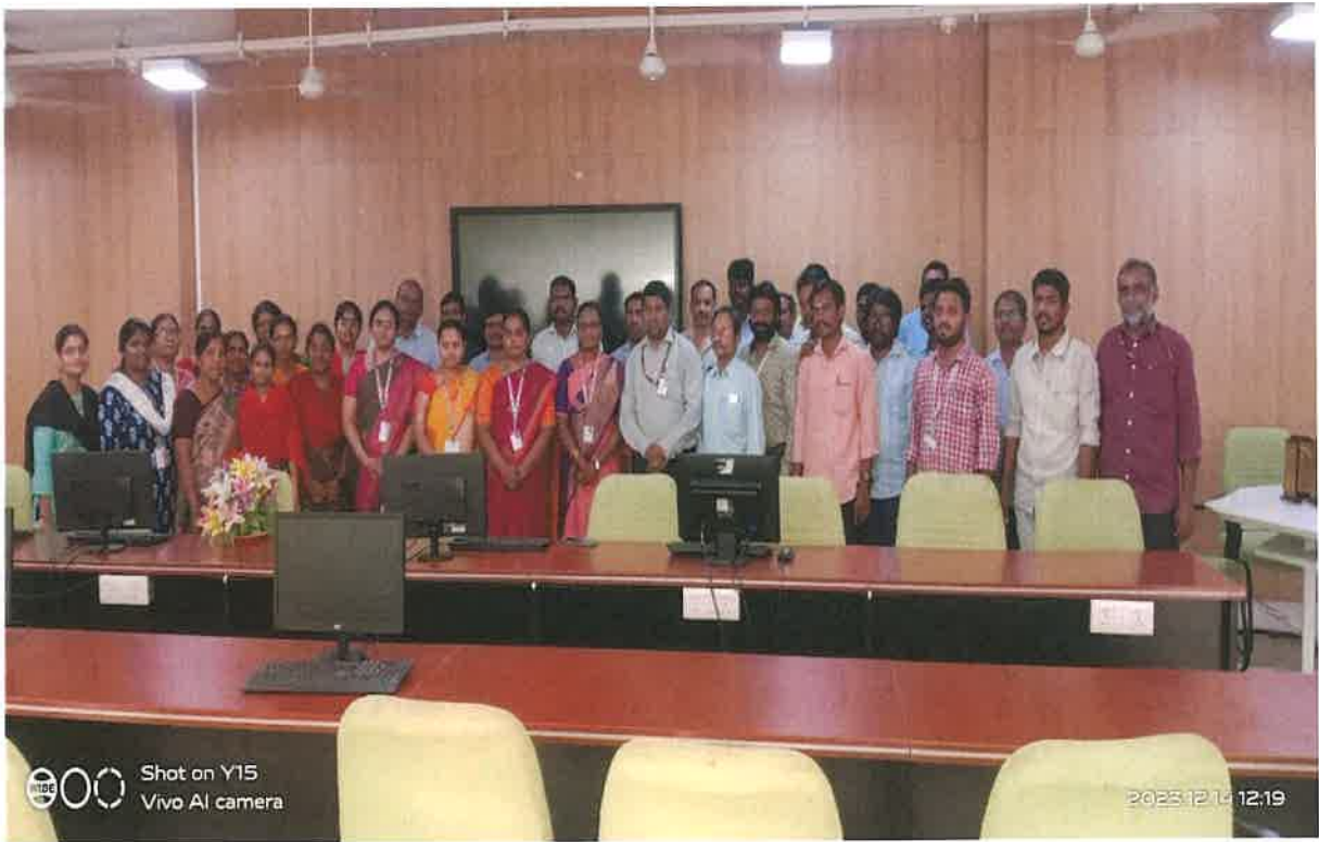
Felicitation to the resource persons and group photo