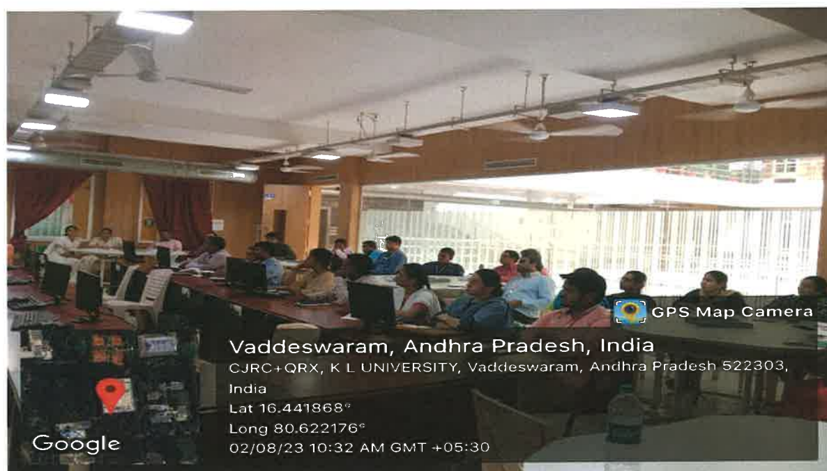
Figure 3: Faculty Attended Orientation on Increasing Student engagement in On-line Education