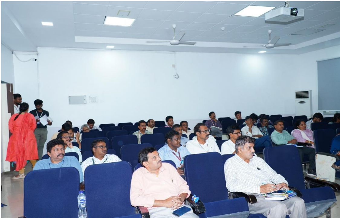
Participants listening to the lecture