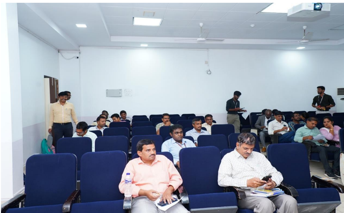
Participants listening to the lecture.

His talk was particularly inspiring for faculty members and students involved in research and innovation. He concluded by stressing the need to embed an IP culture within academic institutions to support India's vision of becoming an innovation-driven economy.