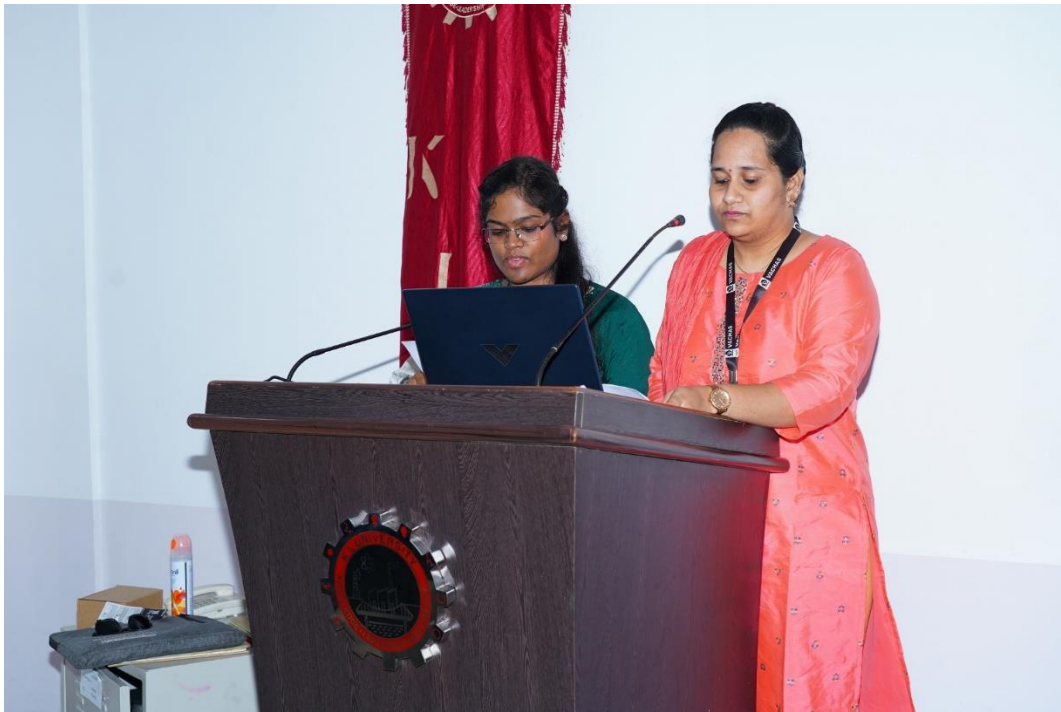
Welcoming the guests and participants

property protection and commercialization, urging the participants to make the most of the workshop.