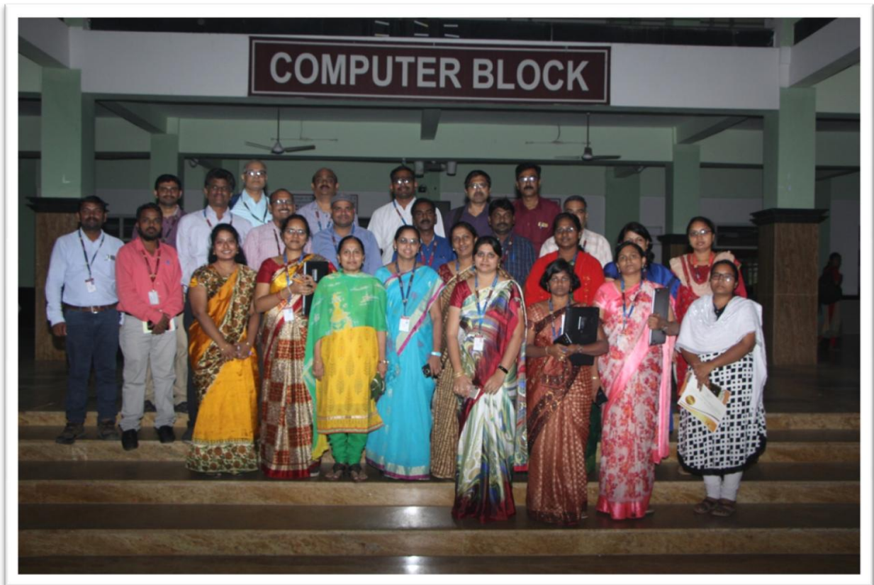
Group Photo of the Participants and Distribution of Certificates