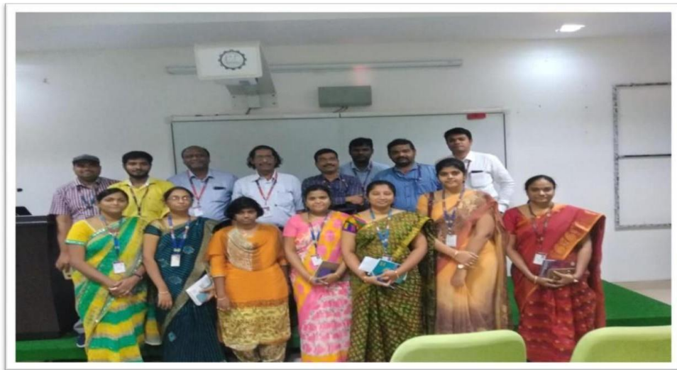
Group Photo of the Participants for the programme on organisational behaviour as of 08.12.18