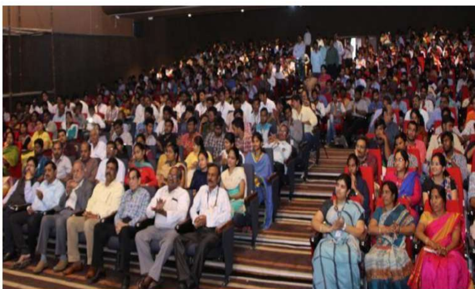
Gathering of Participants as per the dates on 13.12.2018 to 15.12.2018