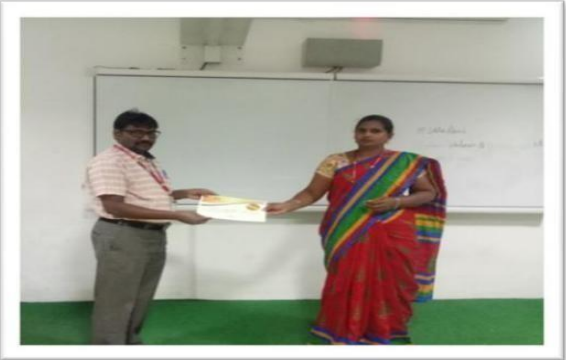
Prize distribution to participants in Human values and ethics event which was conducted on 28-11-2018