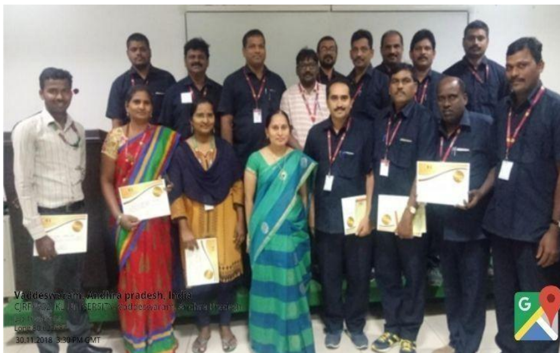
Certificate distribution to vigilance officers in Human values and ethics event which was conducted on 28-11-2018