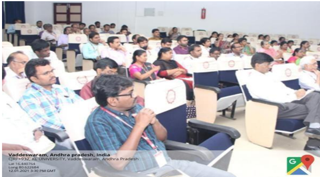
Participants actively listening the program on 12/01/2021.