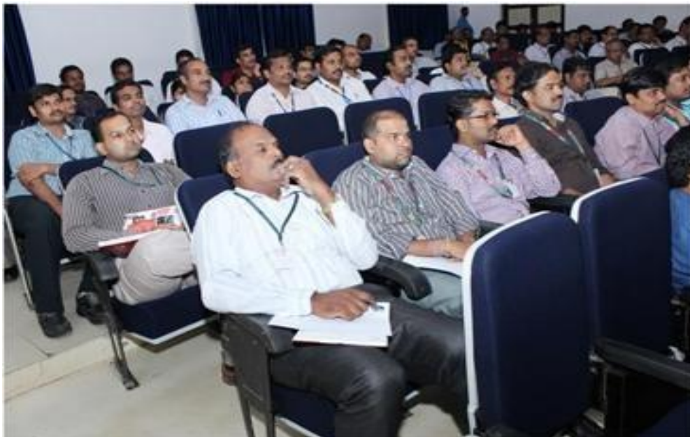
Gathering of Participated Faculty on 9.03.2020