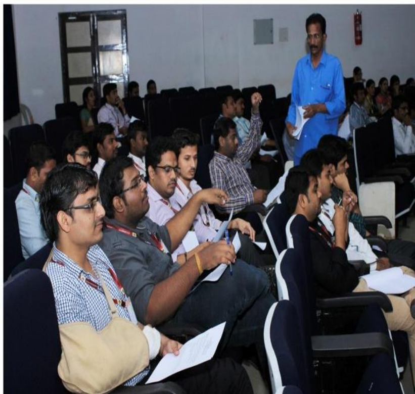
Participated Faculty for the session on 9.03.2020