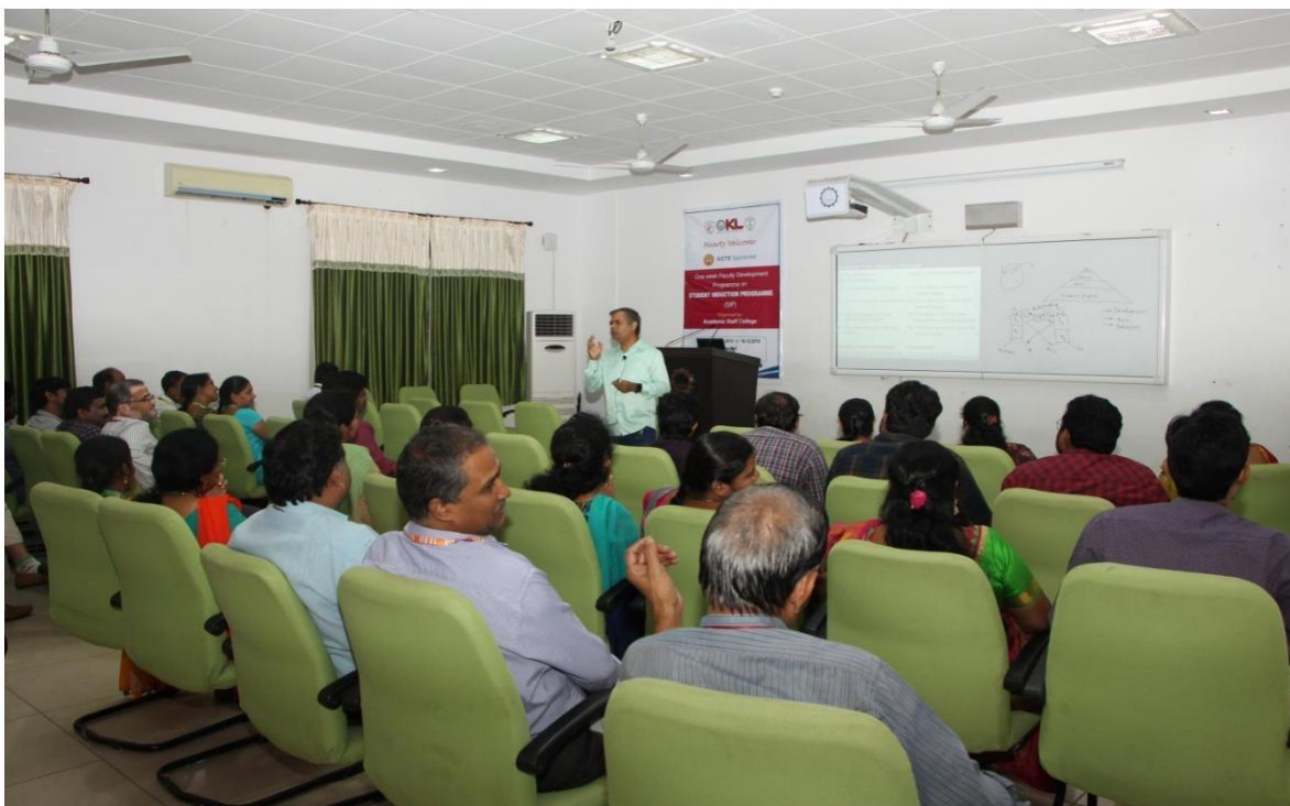
Active participation of participants in the workshop on 10/12/2019.