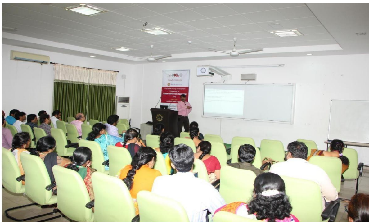
Faculty participants gathering in FDP on 14/12/2019.