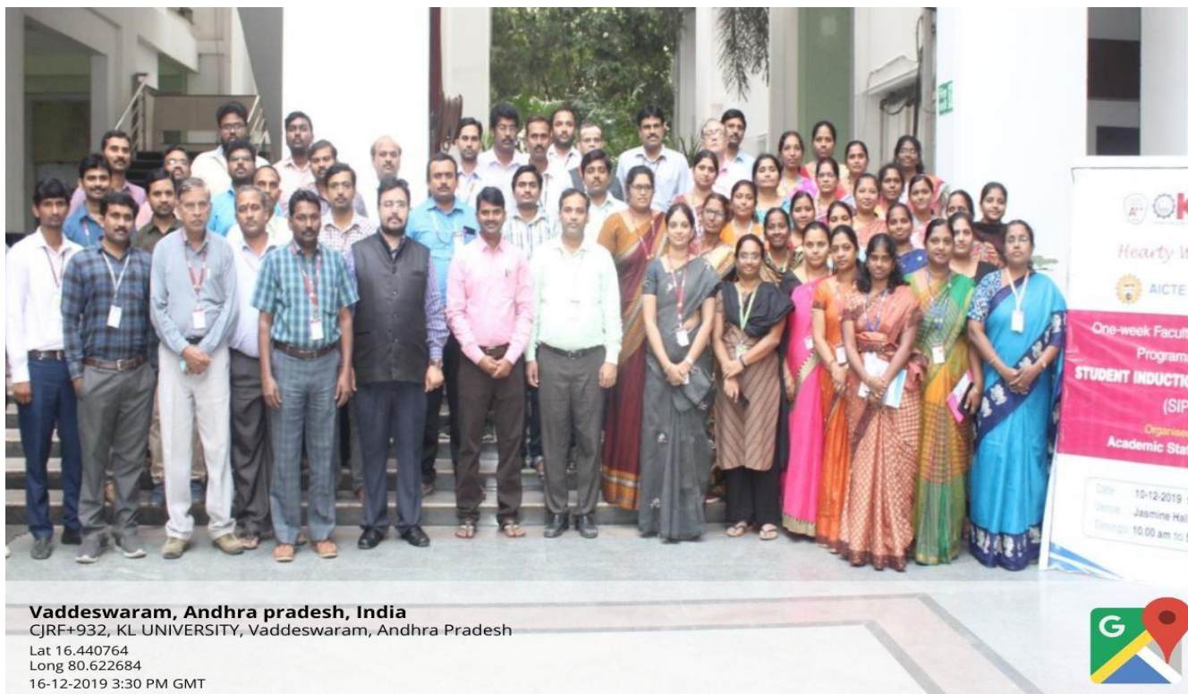
Participants Group Photograph-2