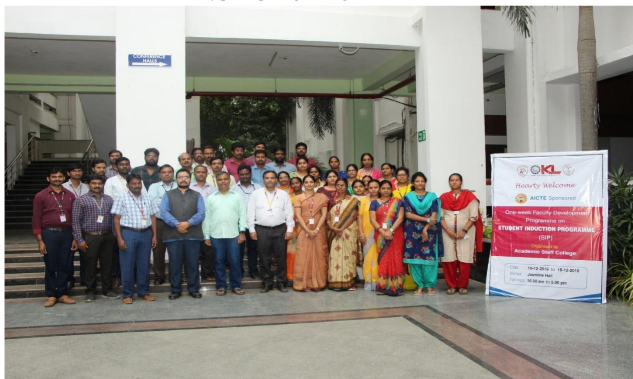
Participants Group Photograph-1