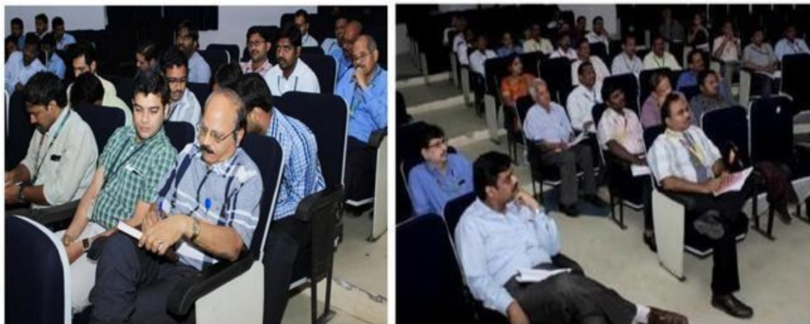
Participants of the Program for personality development as per the dates from 18/11/2019 to 22/11/2019