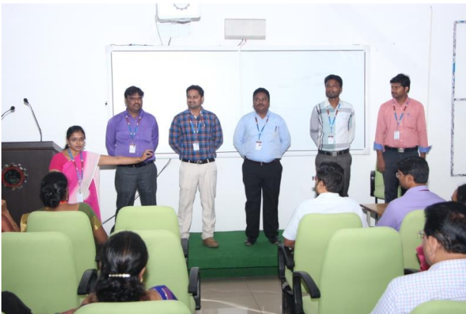
New Joiners faculty presenting their role plays on various course materials