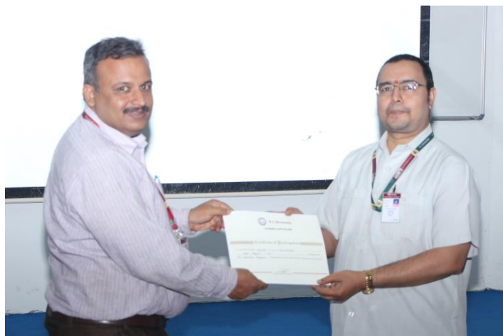
Participant receiving certificate after the completion of the programme