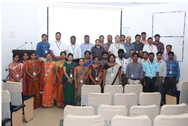
Induction programme participants group photo