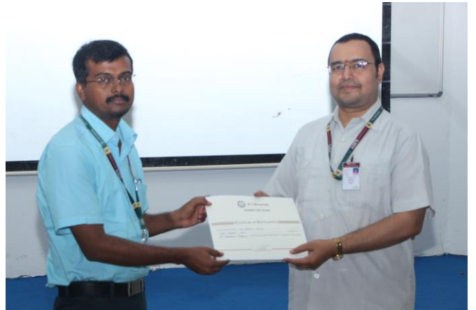
Participants receiving certificate after the completion of the programme