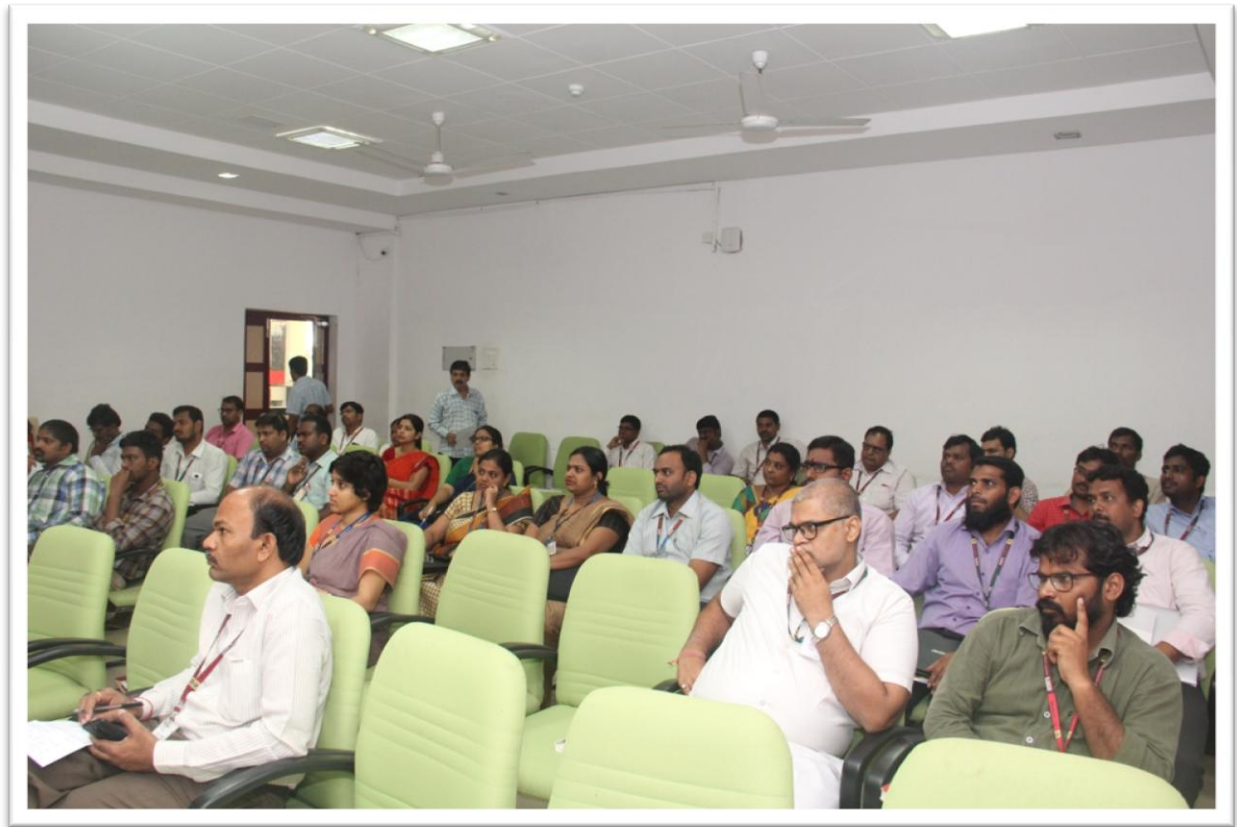
Participants actively listening