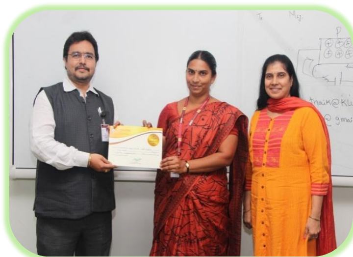
Participants receiving the certificates at the end of the session