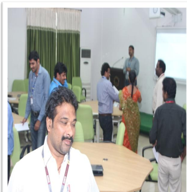
Group Discussion in Session