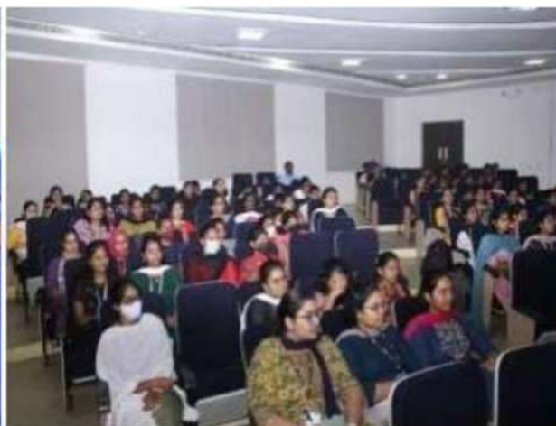
Inaugural Session of National Level Seminar on Involvement of Women & Girls in Science on 14/02/23