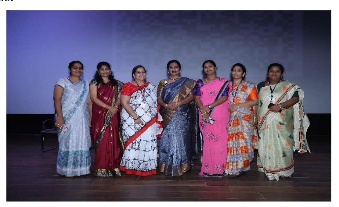
organizing faculty gathered in Dias