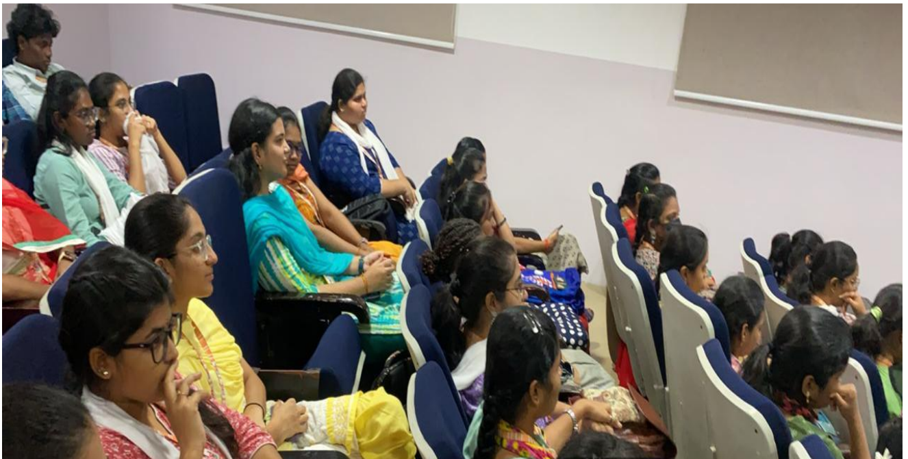
Students are participated in Seminar on Career Planning and entrepreneurship on 29.09.2023