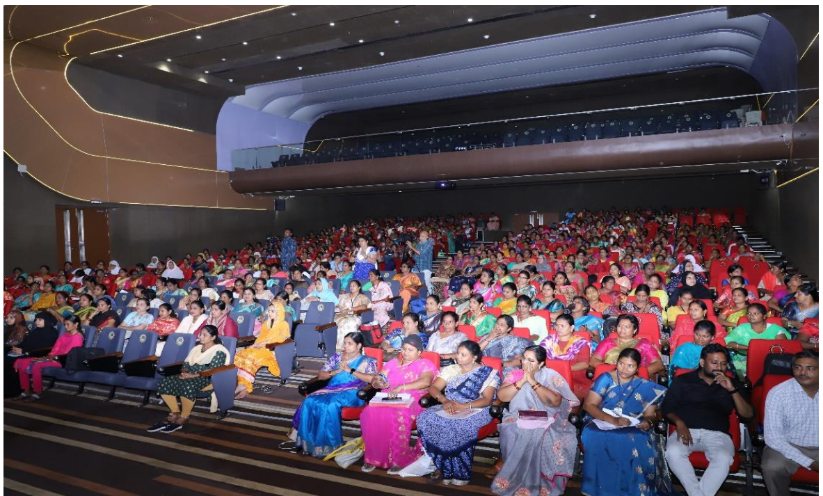
Students are participated in Identifying the Potential Startups among Women Faculty /Staff/Students on 11.10.2023