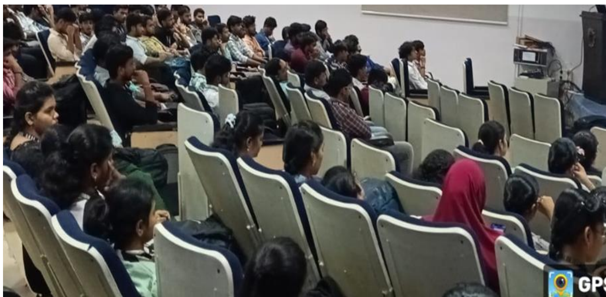
Students participation in Awareness program on Superstitious Beliefs 13.10.2023