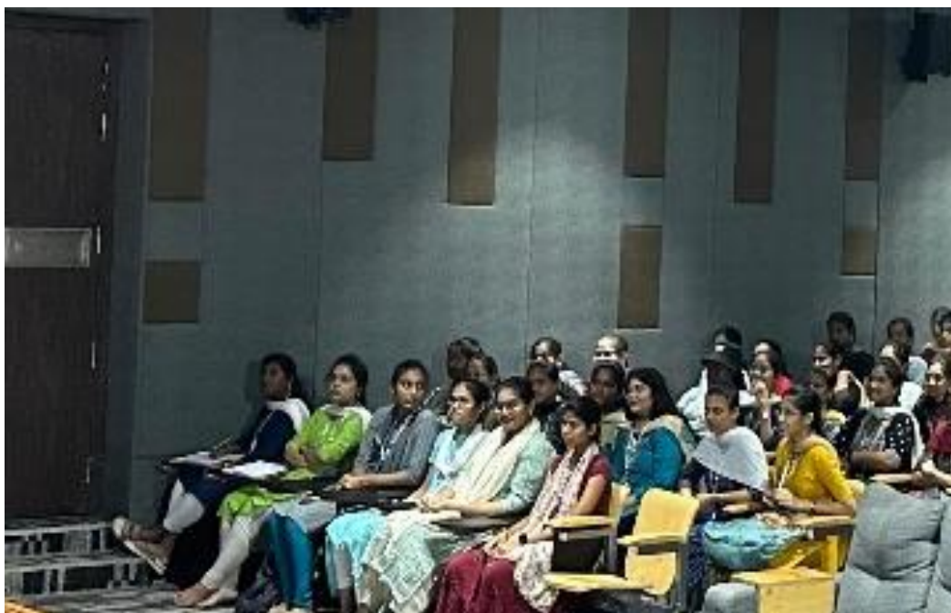
Students are participated in Awareness program on Breast cancer on 19.10.2023