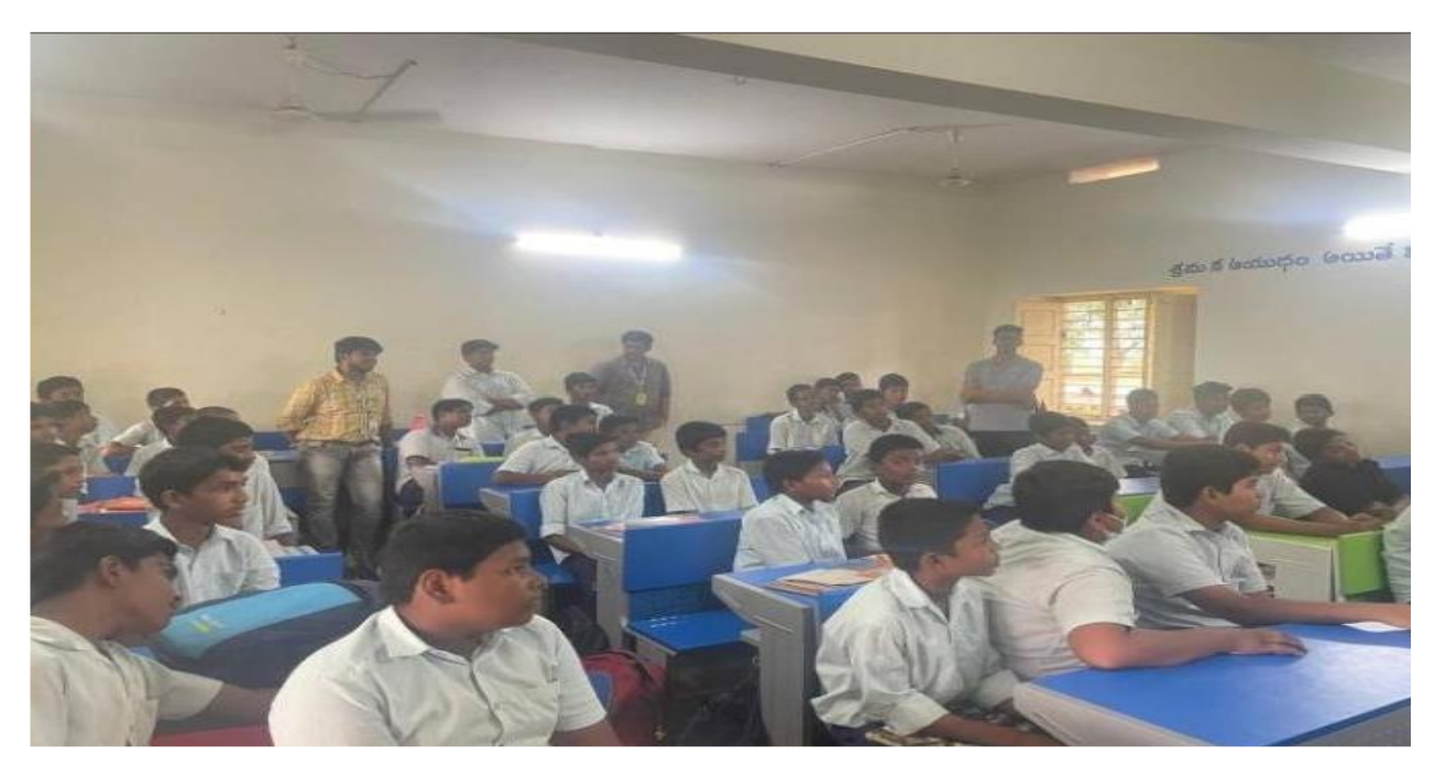
ZPH School, Nallapadu students participation in Workshop on Development of Prototypes (Small Devices Fabrication using IoT)