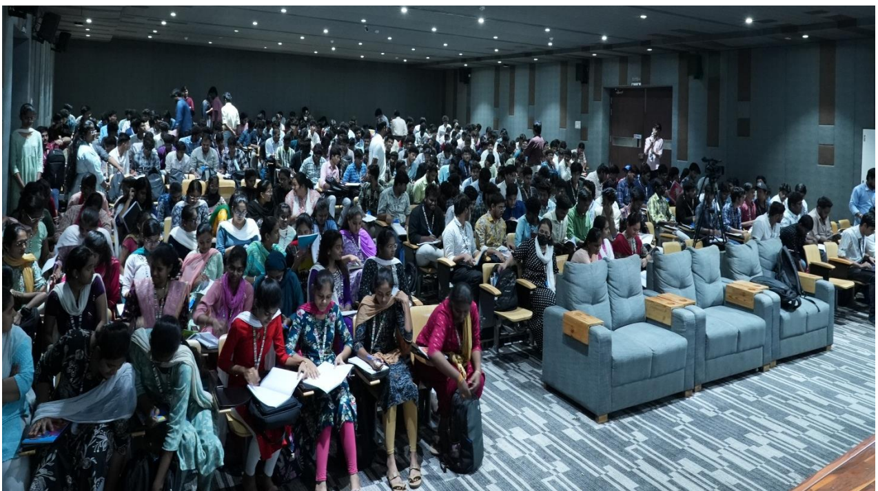
Students are participated in workshop on “Various Government Funding Opportunities & Schemes Towards Startup Initiation” on 06.01.2024 at New Seminar Hall