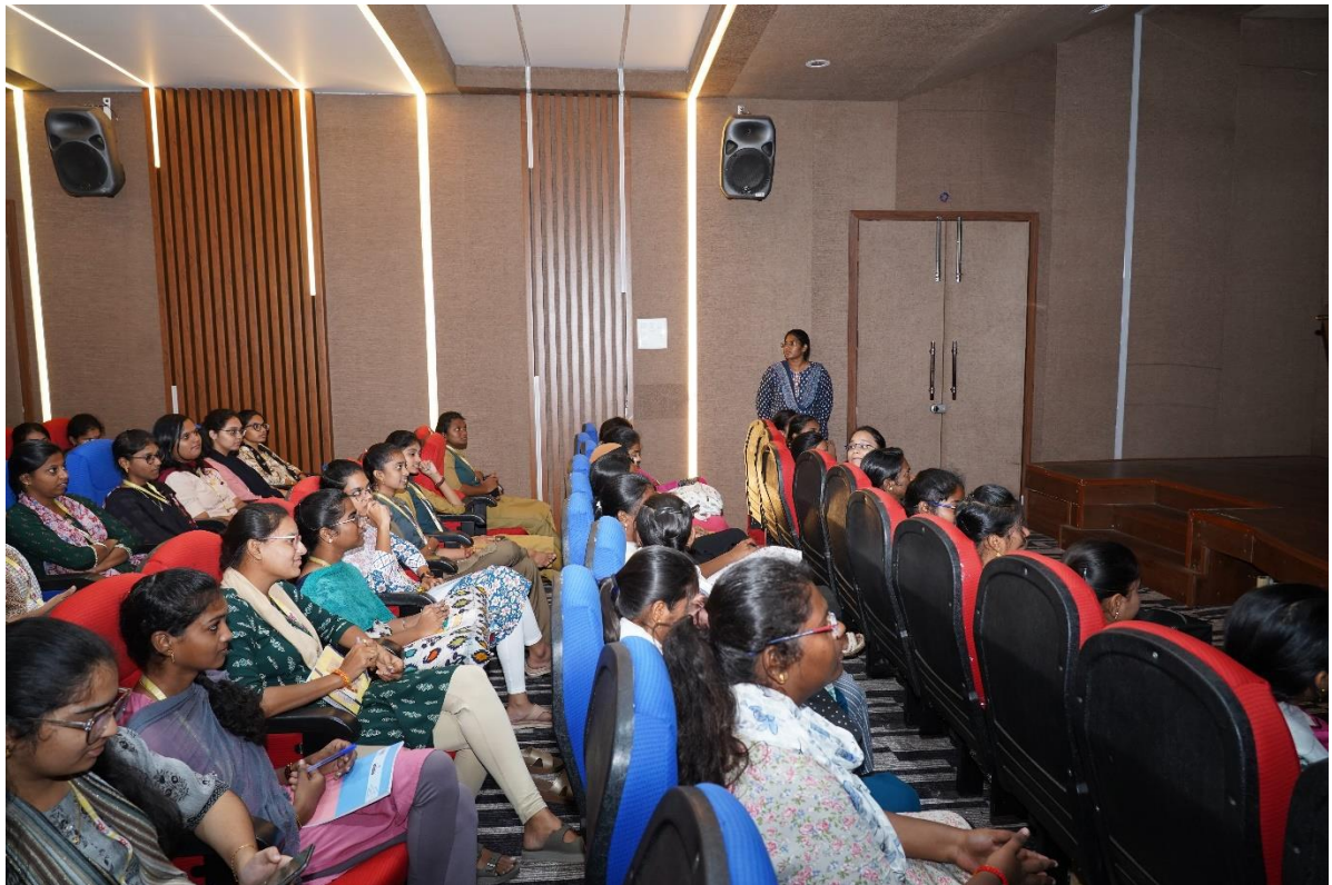
Students are participated in awareness program on Tackling the Decreasing Girl Child Ratio in India on 25.01.2024